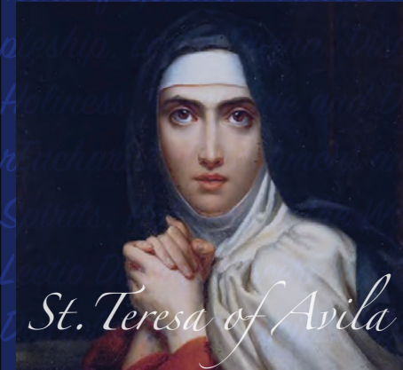
St. Teresa of Avila