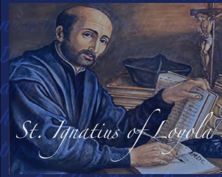
St. Ignatius of Loyola