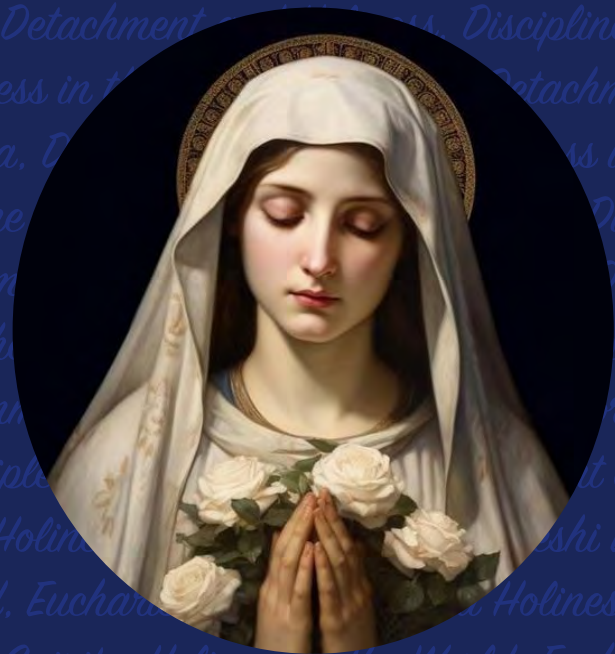
The Blessed Virgin Mary